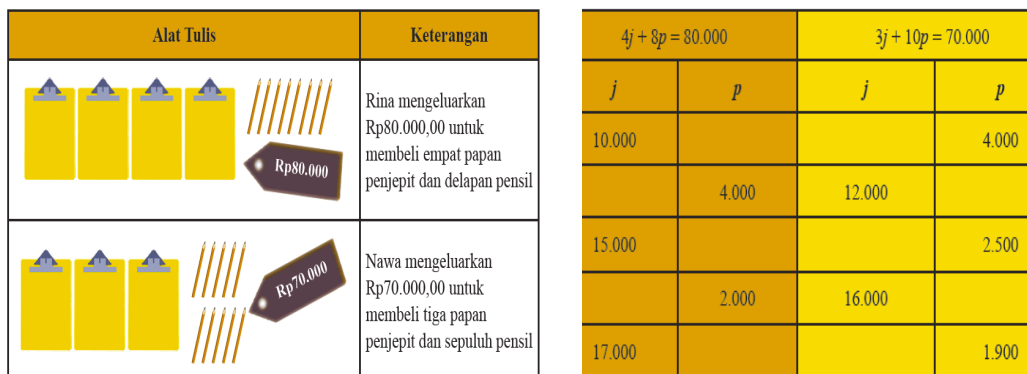
Figure1. Informal strategy for solving SLETV

Explanation of the SLETV begins with the presentation of relevant contextual problems, for example the determination of the price of goods (paperclips and pencils) as follows.