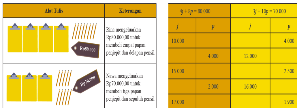
Figure1. Informal strategy for solving SLETV

Explanation of the SLETV begins with the presentation of relevant contextual problems, for example the determination of the price of goods (paperclips and pencils) as follows.