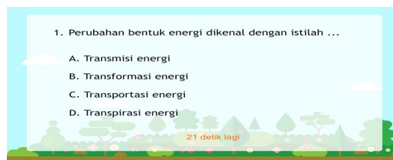
Figure 4: The layout of the Quiz Menu

The menu "Quiz" contained the multiple-choice test items with four answers as many as five items, and were always randomized automatically by the system. This test items were done in 30-minute period, and the scores would appear after all the test item had been answered or when the time limit was over. The menu "Profile" contained the identity of the media creator.