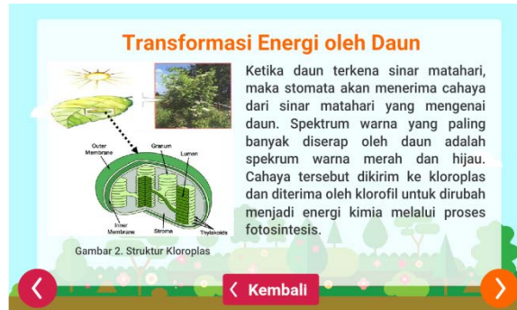
Figure 2: Layout of Material Menu

The menu "LKPD" in Scientific Apps was directly linked to the employed website in this learning, so that the students could directly access the tasks which were given through the smart phone.