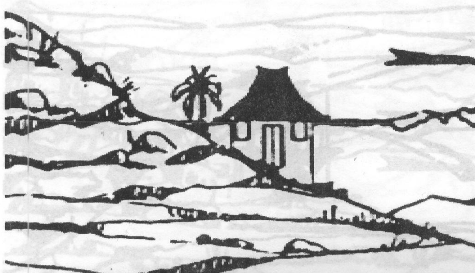
Figure 5. Sri Sadana Land, bring a Lot of Fortune to its Owner by Rudjiman [2000]

Cosmologically, soil is the main element in human life. Soil is also involved in constructing the Javanese spiritual life. Therefore, inside the human body, there are elements of earth, wind, fire, and water. Soil elements, if well managed, causing the body fit and healthy. So if the Javanese carelessly cultivate the land, it is considered to bring in custody (misery).