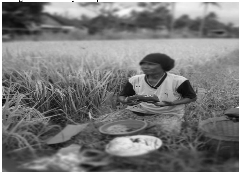
Figure 3. A Citizen is Implementing Wiwit Offeringsi in the Fields

Based on the description from the informant, it is enough to convince that Dewi Sri ritual activity is supported by all the villagers. Every people willingly expend the money and effort, because they have a spiritual responsibility to preserve the myth that could save their lives. The agricultural rituals are performed at the time of harvest, sow the seeds, and put the rice into the rice container (barn). Here is a picture of one of the Prangkokan villagers who are implementing offerings called wiwit (Figure 3).