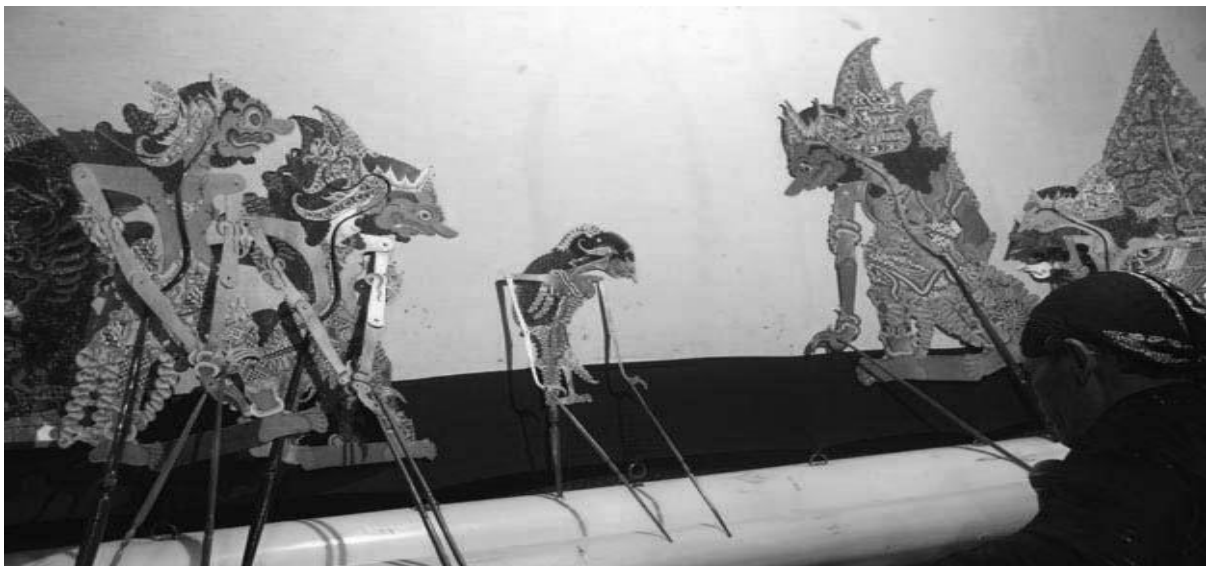
Figure 4. Puppet Show Scene Plays Sri Mulih

The play is an effort to take care of the management of farm land spiritually. Meanwhile, the incorporation of ritual wiwit with clean village ritual is also a symbol of the cleansing tradition. Besides the material leaned in the form of garden soil, the spiritually is also cleaned an inner cleansing effort of the Javanese tradition. Whenever the inner are clean and the ground is clean, the rice planted will blessed and produce fertile soil. Fertile soil is believed to bring fortune in by the community.