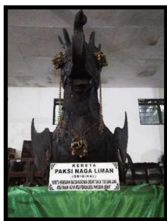
Naga Liman Original Pencana Kencana Train at the Kanoman Keraton Heritage Heritage Museum)