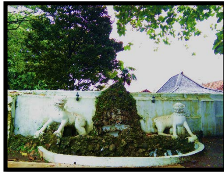
(Personal documentation, Kanoman Palace area complex area)

Seeing Cirebon as a multicultural area, the term Cirebon comes from Caruban which means mixture. Since the mid-15th century there have been a number of censuses of statistical data from each culture, such as Javanese, Sundanese, Chinese, Persians, Majapahit and others. Because in Cirebon there are multi-ethnic groups, Paksi Naga Liman is a form or symbol of multicultural life of the nation and state itself. Since the Singapore era before the Cirebon kingdom, people have been busy visiting and visiting the port of estuary djati, so that a ruler named Ki Gedhe Muara Djati who is commonly called Ki Gedeng Jumanjang Djati accepts various religions that were not yet Islamic and then applied the values of multicultural from various ethnicities, cultures and religions, then Paksi Naga Liman is interpreted at a later stage in the Islamic era by Prince Cakra Buana and Sunan Gunung Jati as a form of cultural assimilation, religious assimilation, ethnic assimilation both in China, Gujarat and India.