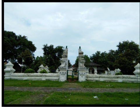
(Personal documentation, front view of the Kanoman Palace)