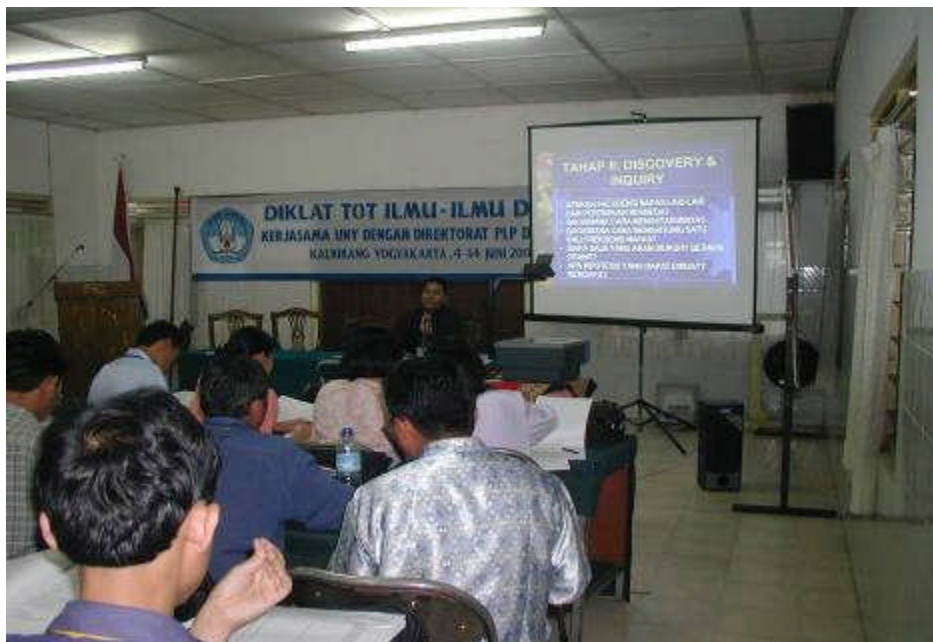
Picture: National Level of Training of Trainer (TOT) for Basic Science, in Yogyakarta, 4-14 June 2003