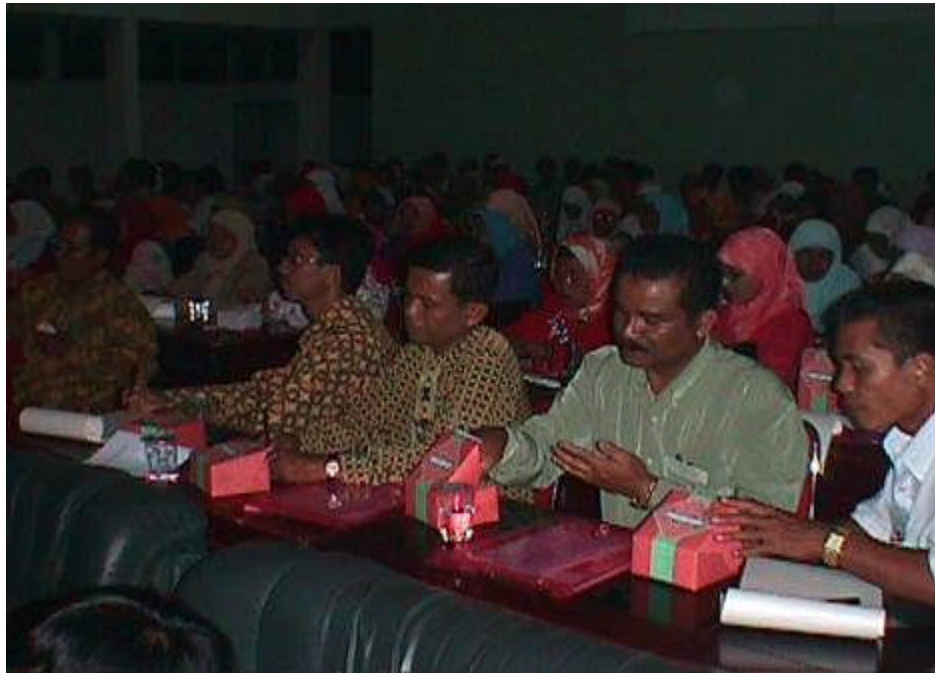
Picture: Monitoring and Evaluation of the Piloting of Competent-Based Curriculum for Mathematics in Padang, West Sumatra, January 2005