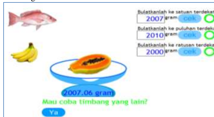
Figure 2. The Rounding Virtual Teaching Aid

The validity of the virtual teaching aid of a rounding material which has been developed and assessed can be seen in Figure 2 below: