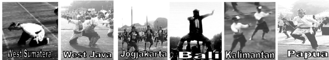
Picture: typical dance and martial arts illustrations

Contribute to sports science in Pencak silat Nusantara dance body fitness levels will have a positive effect on appearance. To achieve good body fitness needs to be done regular, directed and programmed exercises. Body fitness can be defined as a person's ability to perform physical activity in a long time without experiencing significant fatigue. These physical activities include running, walking, working, including dancing and more. Dancing requires good physical support. Physical abilities include strength, endurance, balance, flexibility and others. For the preparation of PSN dance so as not to cause injury and the emergence of health problems, then in the preparation also pay attention to supporting science such as anatomy, physiology, kinesiology and mechanics, physical condition and fitness body. [9] developmental dance movement can provide opportunity for physical, cognitive advancement for young children. Investigating learning through developmental dance movement as a kinesthetic tool in the early years foundation stage. This is in line with that expressed by [10] that the results of his study reveal the impact of bringing rest and imagery into her dance classroom (techniques drawn from somatic practice), the teaching fellow learns how to teach anatomical awareness to her high school students and to help them apply anatomy concepts to their ballet technique.