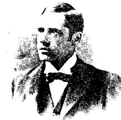
'Banjo' Paterson